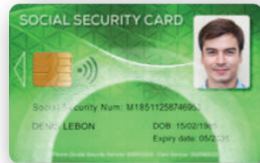
Card printed with standard YMCKO ribbon

Cards after 300 abrasion cycles (Taber test, ISO CEI 24789)