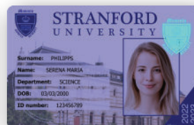
Under UV light

It is also possible to insert the same element in both layers to get a more intense UV effect, in a place where printing protection is not needed.