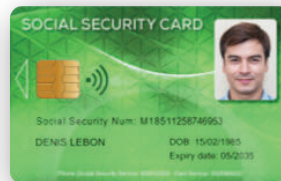
Card printed with YMCKOO ribbon

Bringing extra durability without lamination, YMCKOO ribbon is a cheaper and more convenient solution when patch protection is not required.